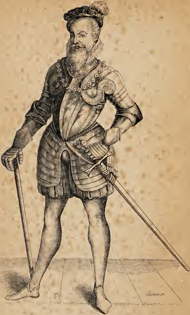
THE EARL OF LEICESTER.